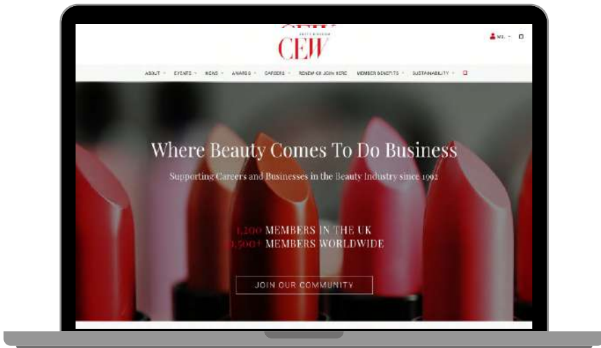
Our Website (cewuk.co.uk)