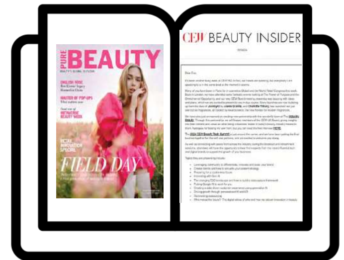
Our Weekly Newsletter, Pure Beauty Magazine subscription and partnership, our partnerships with Luxury Briefing and The Industry.Beauty